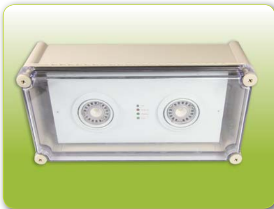
“CRYSTALITE” Cat. CE-DPW-2X3W-WP